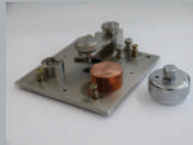
Small parts adapter kit

Material control presents a wide range of analysis requirements. Two specific challenges: adjusting to samples' differing shapes and sizes, and optimizing positioning on the spark stand. Fortunately, SPECTROMAXx's adapter kit offers a variety of flexible, easy-to-use solutions.