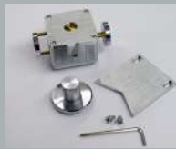
Adapter for wires/screws or small parts with a diameter of 0.8-10 mm