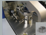
Adapter for wires with a diameter of 0.8-3 mm