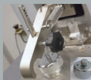
Adapter for small pieces